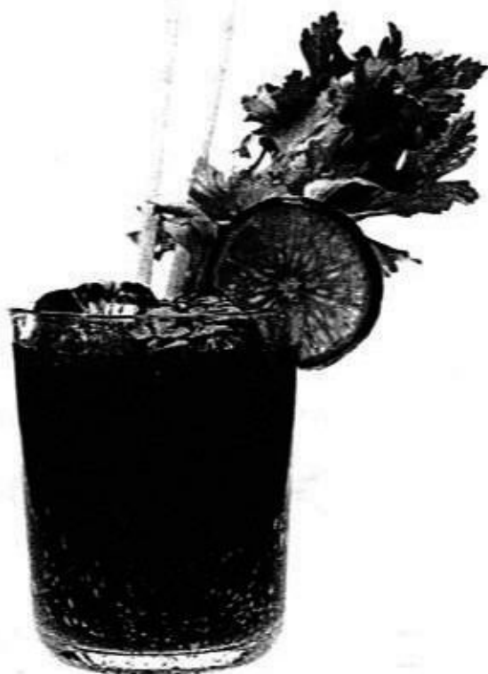
MIXING A BLOODY MARY.

INTO A SHAKER FILLED WITH ICE POUR THREE OUNCES GIN OR VODKA AND ONE-HALF OUNCE (OR LESS) DRY VERMOUTH. SHAKE; STRAIN INTO A MARTINI GLASS. GARNISH IT WITH AN OLIVE OR LEMON TWIST.