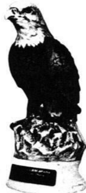
CLOSED WING EAGLE