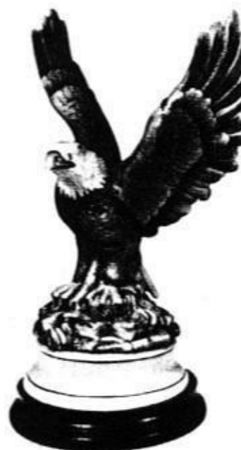
OPEN WING EAGLE