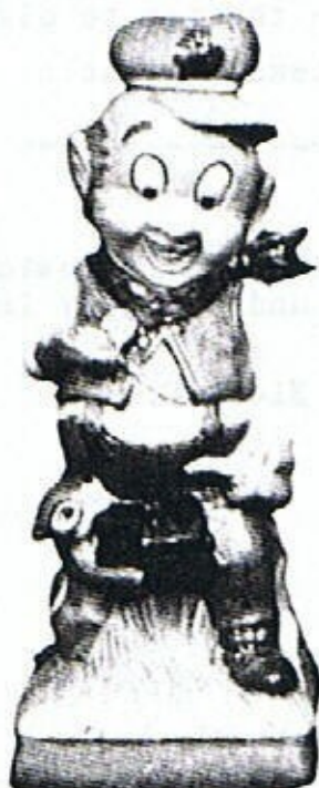
MR. RAILROAD ENGINEER