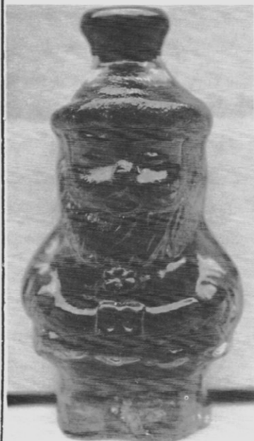
Santa shown slightly larger than actual size.

Molded glass set of four: Lion, Santa Claus, Bear and Angel.....$24.95 (counts as one bottle in shipping)